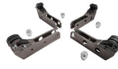
GRIP MAX® PLUS 28" CLAMPS (PN 85607986)

Offers twice the slip resistance than the traditional clamps and built in rim protectors eliminate metal on metal contact.