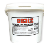
PASTE LUBE BUCKET (PN 8183710)