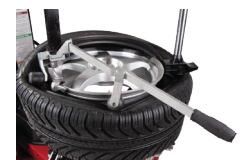
MANUAL BEAD DEPRESSOR & DUCKHEAD® ROLLER (PN 85609077)

Provide a standard external clamping range of 16" up to 28", allowing the convenience of working on a multitude of tire assemblies.