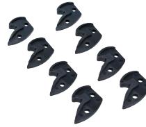
GRIP-MAX® PLUS REPLACEMENT GRIP SET - 8 PACK (PN 8560716108)