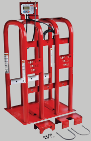
EL-X EXPRESS LANE® INFLATION SYSTEM (PN 85607770)

Eliminates the inflation process wait time on the tire changer resulting in faster bay turns and reduced customer wait times.