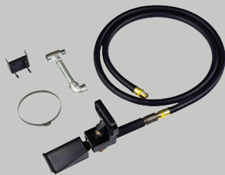
AUXILIARY BEAD SYSTEM (ABS) (PN 85606545)

The Coats® Point of Use Lift System helps you elevate heavy tire and wheel assemblies up to tabletop height with minimal effort.