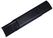
LIFT TOOL SOCK (PN 85000783)