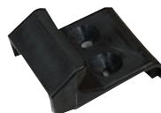
STEEL CLAMP INSERTS (10) (PN 8183604)

Combo design insures the bead stays in the drop center and tire bead does not roll back over the Duckhead® mount/demount tool.