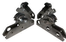
GRIP MAX® PLUS CLAMPS (PN 85607787)

Offers twice the slip resistance than the traditional clamps and built in rim protectors eliminate metal on metal contact.