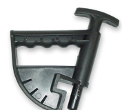
MANUAL DROP CENTER TOOL (PN 8435685)